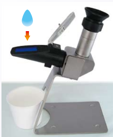
① Open the daylight plate and apply a sample liquid on the prism.